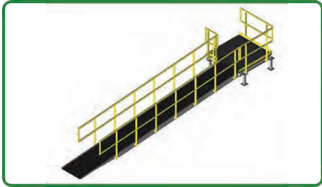
ADA Ramp & Platform Unit

Bebco Industrial Duty Stairs, ADA Ramps & Platforms are available in any configuration you desire. We have provided typical configurations below to simplify getting a quote for the most common applications. We hope you'll see a configuration that meets your need, but if not, no worries! We're ready to manufacture whatever you have in mind!