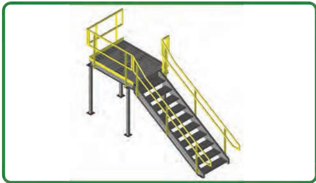
Side Stairs & Platform Unit