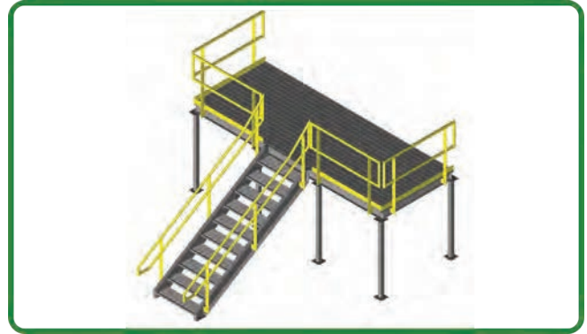
Front Access Stairs & Platform Unit