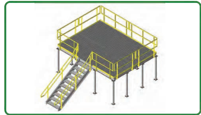
Equipment Stairs & Platform Unit