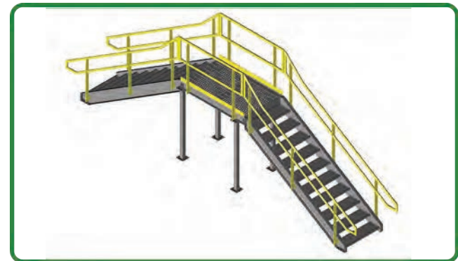
Cross-Over Stairs & Platform Unit

Please use our website's detailed or quick online inquiry forms or call now to get a quote!